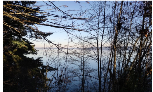
The Puget Sound

On a windy, three-layers-of-clothing type of day, I wondered the woods of the Pacific Northwest while on retreat during 2025 FORMA conference in Seattle, WA. The Puget Sound to my left, magical moss and the greenest of trees to my right, I set down a path, thinking all I'd encounter would be more woods. Then I ran right into it: The Ninth Station – Jesus Falls a Third Time. During Lent, we pray the Stations of the Cross every Friday at St. Mary of the Hills. We rotate through the 14 Stations recalling the series of events through which Jesus spent his last days. We move from his condemnation into his burial.