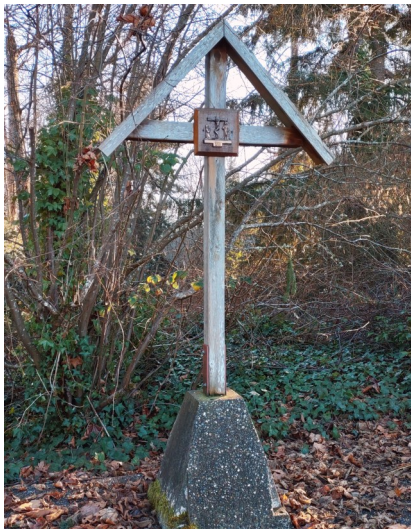
An encounter with Station XII

Unbeknownst to me, this retreat center has a set of outdoor Stations. The beautiful, moss covered monuments are awe-inspiring. I didn't follow the Stations in the order we pray them, but that didn't matter. Each of the moments I ran into a Station was a surprise encounter with God. Now, I can hold each of those moments close to me as I pray the Stations during the Lenten journey I take with you all this season. Whether praying the indoor Stations at St. Mary's or elsewhere, or while praying the outdoor Stations we share with our neighbors at Rumble, each step holds possibility and wonder.